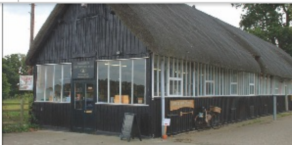
The Daffodil Barn at Woodborough