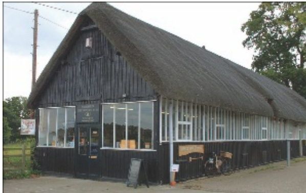
The Daffodil Barn at Woodborough