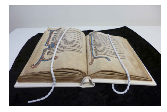
The psalter in its repaired condition

This psalter is believed to have been written and bound in France. It was in poor condition and underwent poor quality repair in 1815 into an unsuitable calf binding which was in very poor condition. After its rebinding it had been vandalised in the 19<sup>th</sup> century with pieces of parchment cut out and knife slashes