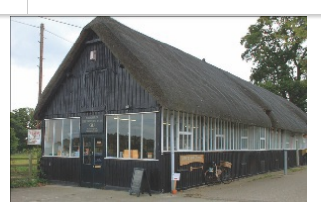
The Daffodil Barn at Woodborough