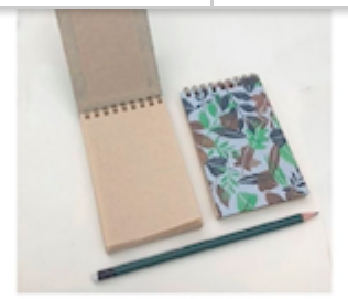
GARDEN Notebook Page size 120×78mm 50 leaves of Tyger Kraft Spiral bound over covered boards