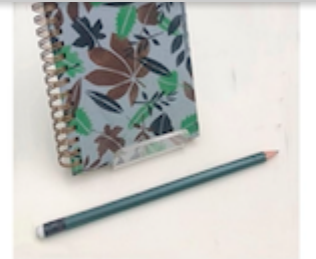
GARDEN Pocket Book Page size 135×103mm 80 leaves of Tyger Kraft Spiral bound over covered boards