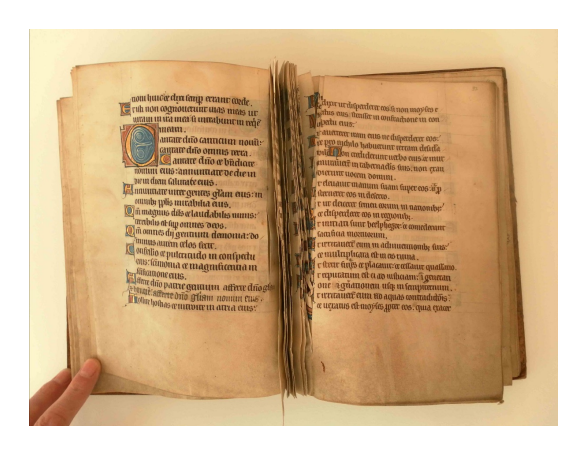
A Vandalised 13th C Psalter

This psalter is believed to have been written and bound in France. It was in poor condition and underwent poor quality repair in 1815 into an unsuitable calf binding which was in very poor condition. After its rebinding it had been vandalised in the 19<sup>th</sup> century with pieces of parchment cut out and knife slashes