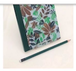
GARDEN Journal Page size 152×130mm 80 leaves of Tyger Kraft Quarter bound sewn sections

Examples of the "Garden" pattern notebooks made by BBV members. For further information of these and other products see the BBV website at <a href="http://wiltshirebarn.co.uk">http://wiltshirebarn.co.uk</a>