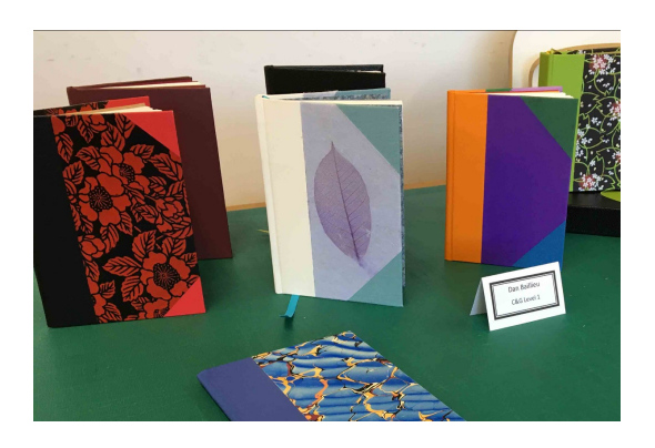
A close-up of Dan's beautiful Level 1 work