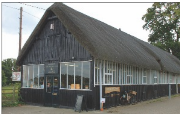
The Daffodil Barn at Woodborough