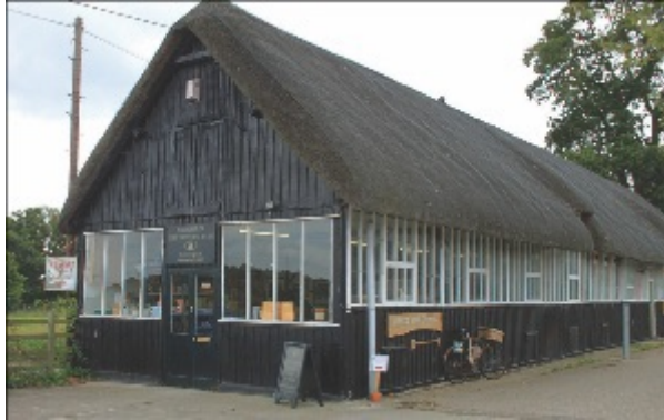
The Daffodil Barn at Woodborough