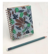
GARDEN Pocket Book Page size 135x103mm 80 leaves of Tyger Kraft Spiral bound over covered boards