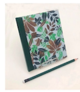
GARDEN Journal Page size 152x130mm 80 leaves of Tyger Kraft Quarter bound sewn sections

There will be plenty of fun activities and other stalls at the fair and it promises to be a great day out for families.