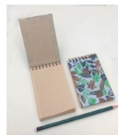
GARDEN Notebook Page size 120x78mm 50 leaves of Tyger Kraft Spiral bound over covered boards

The BBV notebooks will be on sale at the Country Fair. At three different prices they make perfect presents - please do come if you are in the Wilton area and stock up for (dare I say it) Christmas!