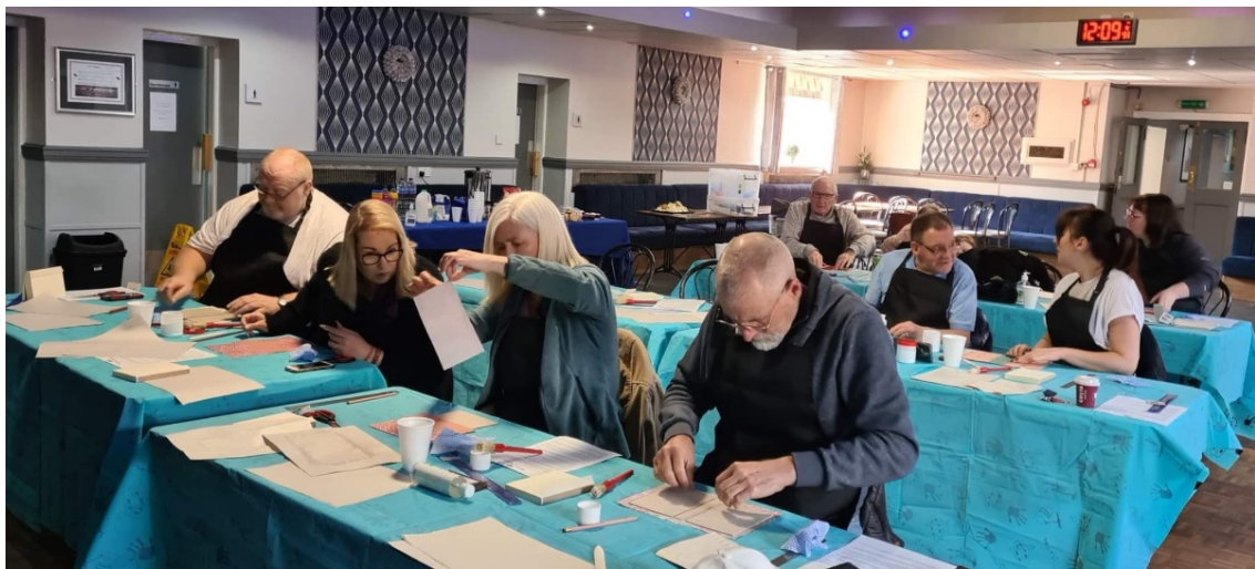
Students in Fife getting enthusiastically stuck into their bookbinding project...

We look forward to delivering more of these later in the year."