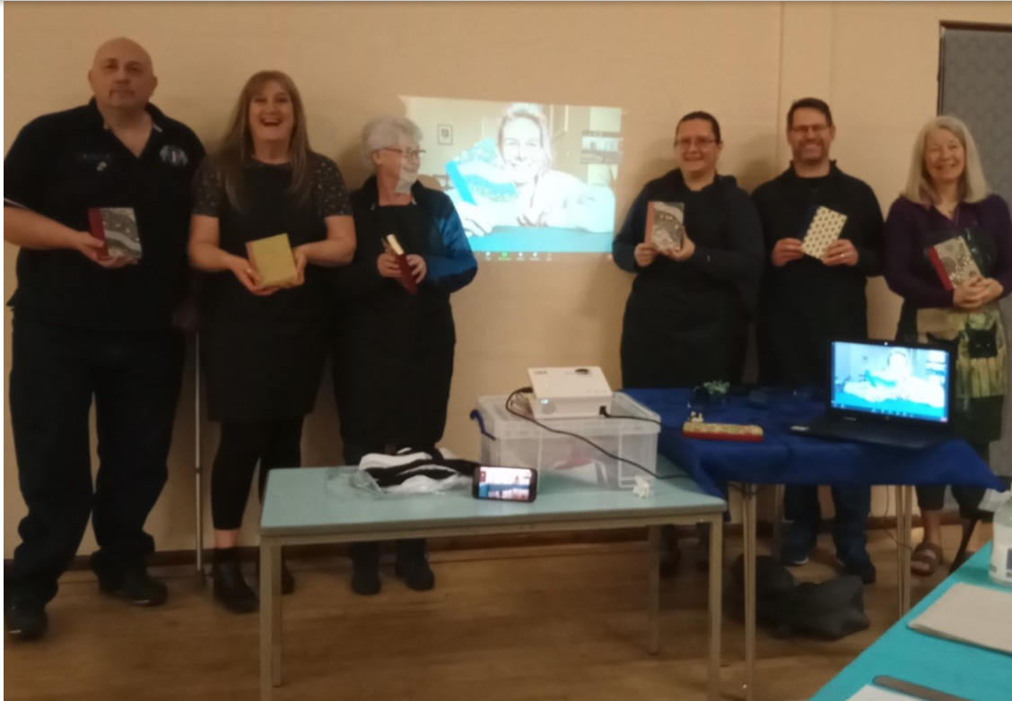
The group from Moray showing off their finished books.

The feedback from the sessions was very encouraging. Here are some of the comments: